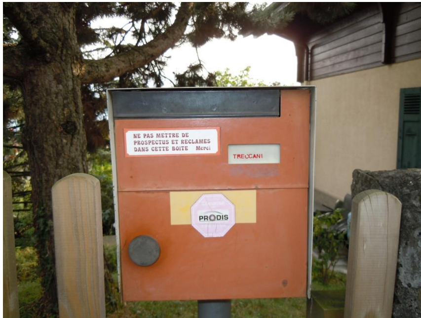
Letter box of TRECCANI