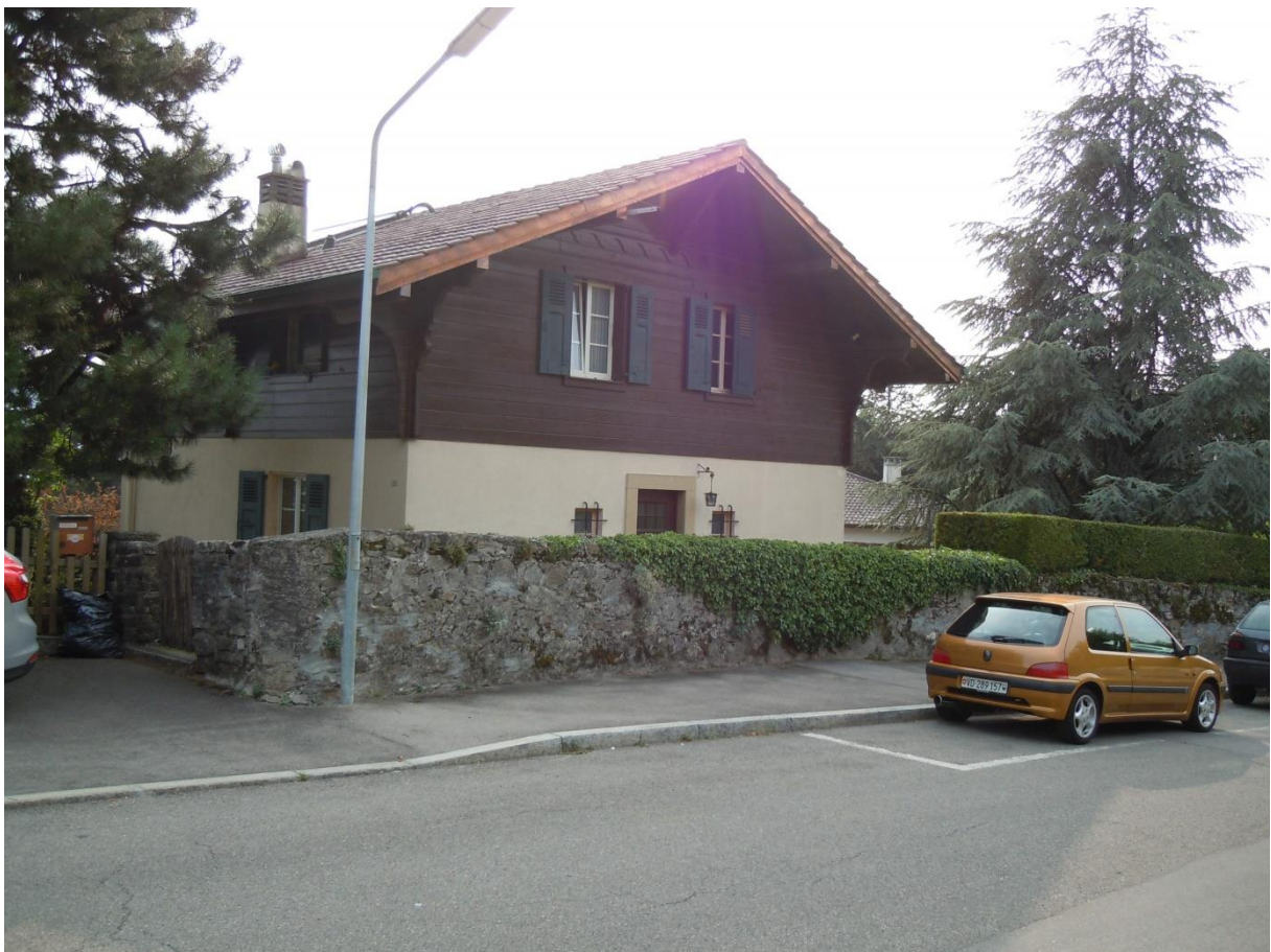
Chalet owned by TRECCANI, entrance at the North