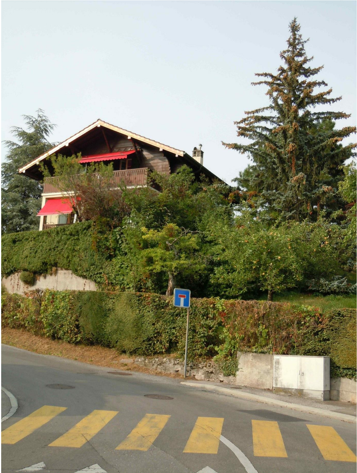
Chalet of TRECCANI, South facade, facing Lake Geneva