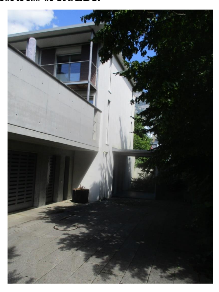
East facade – Entrance