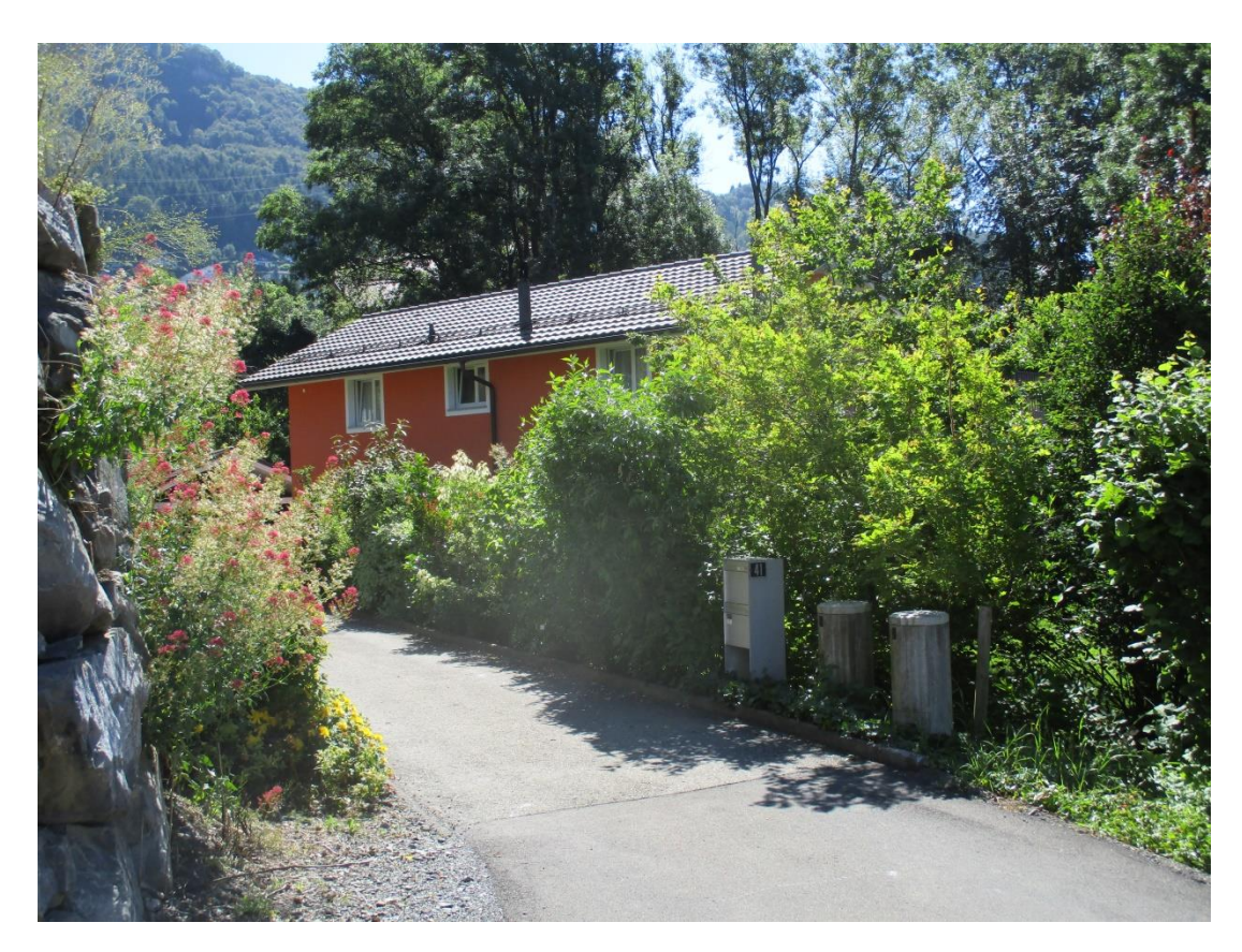
The access to the villa from the west