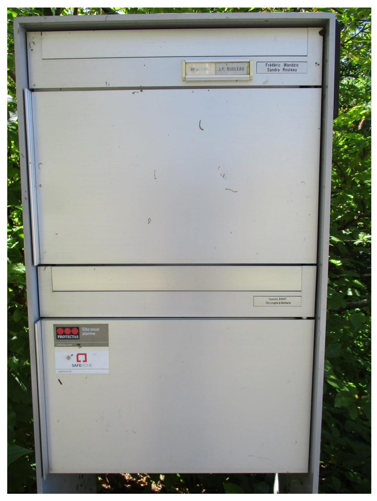
According to the inscription on the mailbox, ROULEAU is cohabiting with Frédéric WANDZIO and a person named J.P. ROULEAU.