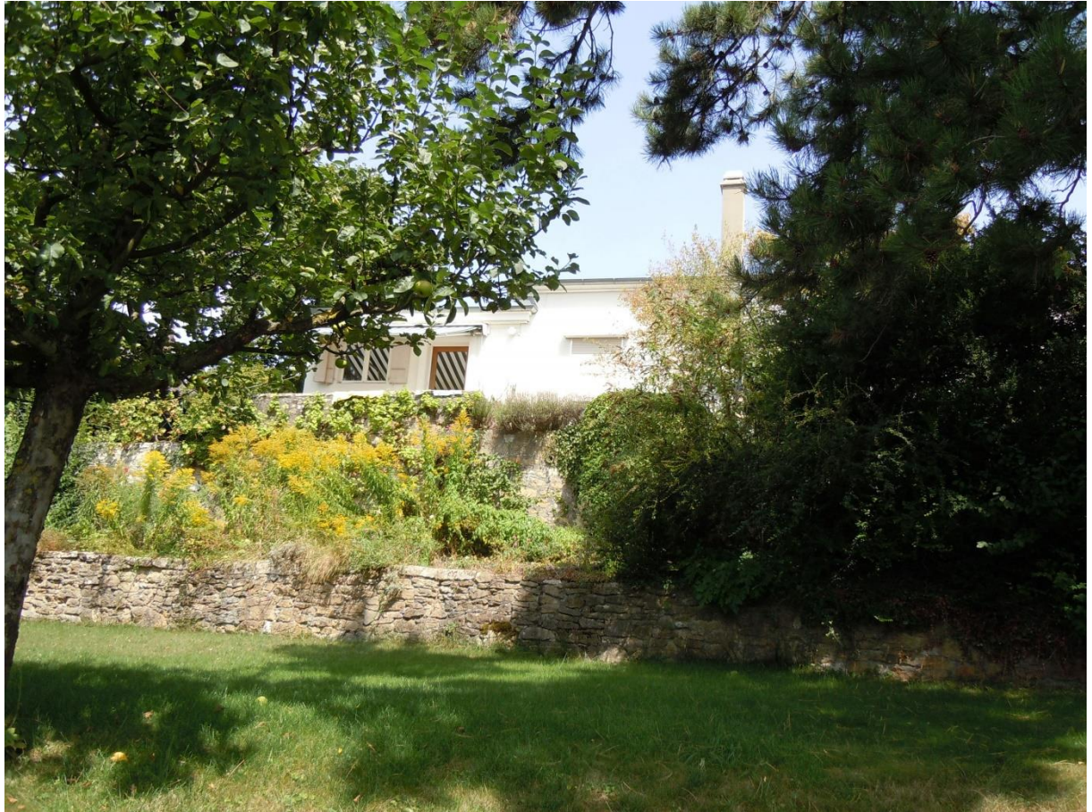
Facade facing Lake of Neuchâtel