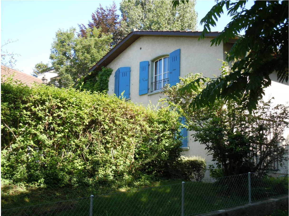
Villa of MEYLAN, seen from the Lake side