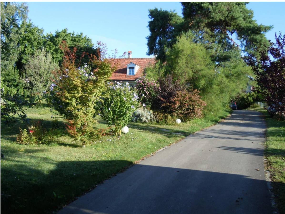
Villa DE MONTMOLLIN on the beach of Lake of Geneva – south facade