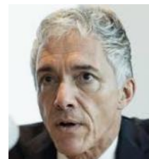
Michael LAUBER Prosecutor of the Confédération