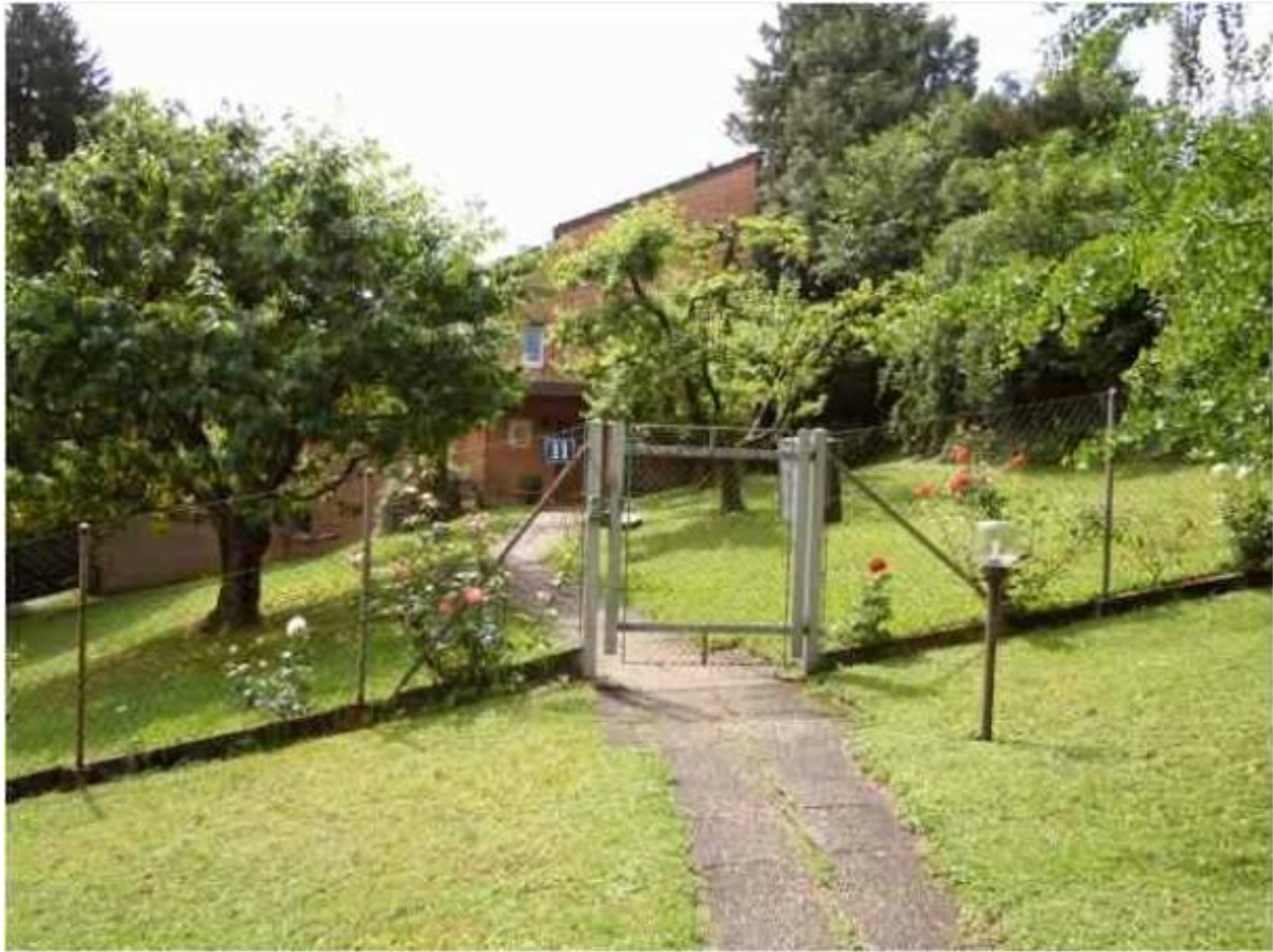
The villa of COTTIER, from the single access path (north)